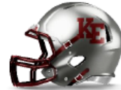
Kildonan East Reivers

Sr. (Varsity) Football @ Kildonan East Collegiate (Eastside Eagles Field) (Winnipeg, MB) 4:30pm